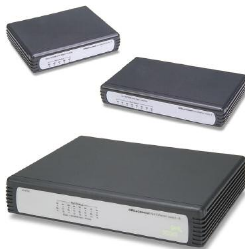
top to bottom: OfficeConnect Fast Ethernet Switch 5, Switch 8 and Switch 16

10/100 Mbps switches for small and medium businesses needing basic connectivity