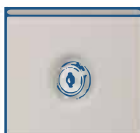
Security Cam Locks