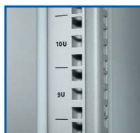
Mounting Pole w/screen UH