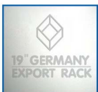
Front Door w/logo