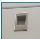
Slide Latch w/logo