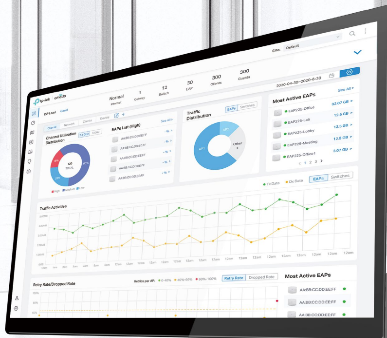
Omada Pro SDN Controller